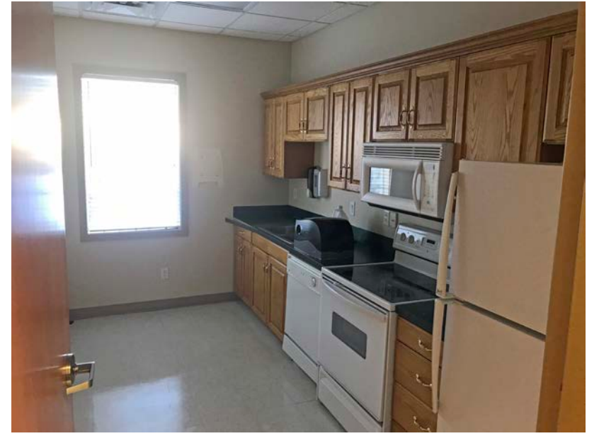
This information was obtained from sources believed reliable but cannot be guaranteed. Any opinions or estimates are used for example only.